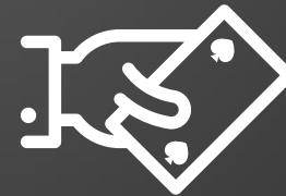
Those who play professionally

...to get involved in our initiative and