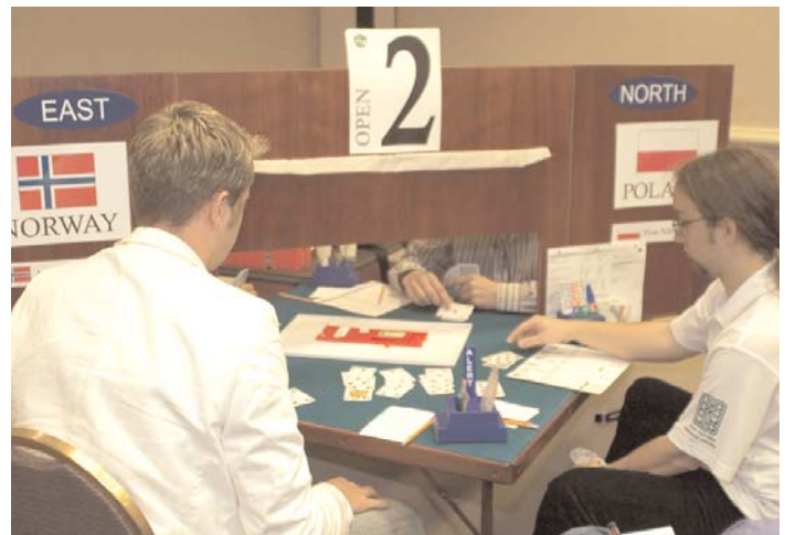
Table action between Norway and Poland

Norway's hopes will hinge on their securing a victory against USA Red, whilst at the same time they will be hoping that Israel do not lose to Canada. If results go according to the form book it looks as if Europe will score an impressive treble by capturing all three medals.